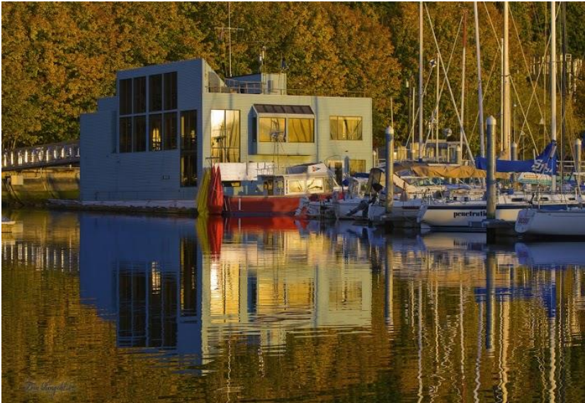
Clubhouse at Shilshole Bay Marina, Ballard