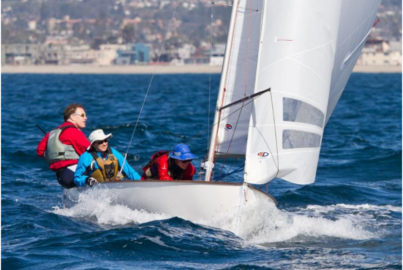
Ranger – 2014 Boat of the Year